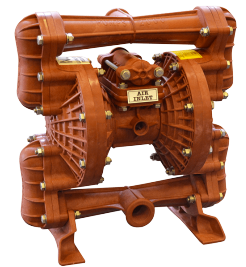
Red Series - P25SR FRAS (Fire Retardant Antistatic) Nylon Body- Hytel Elastomers- For Explosive Environment- ATEX M1 Rating

Yellow Series General Purpose Nylon Body – Hytel Elastomers ATEX M2 Rating