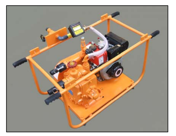
MegaSpray 125 diesel

Used to pump either neat or dilute dispersant. Dispersant dilution gives approximately between 6% and 30% pumping ratio with sea water.